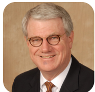
pastor's PEN BRO AL